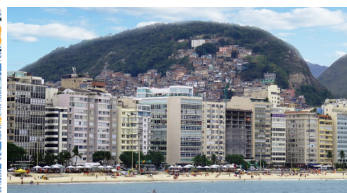
Rio de Janeiro, RJ